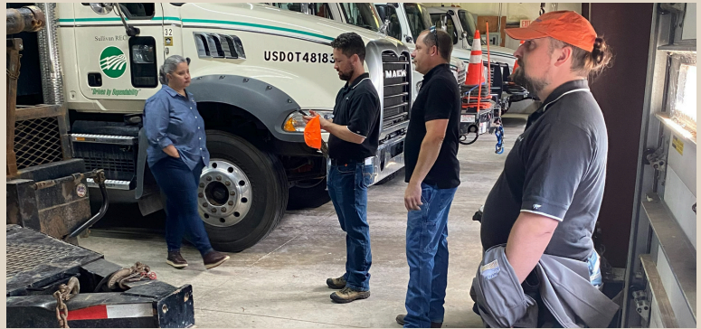
PREA staff touring our co-op's equipment.