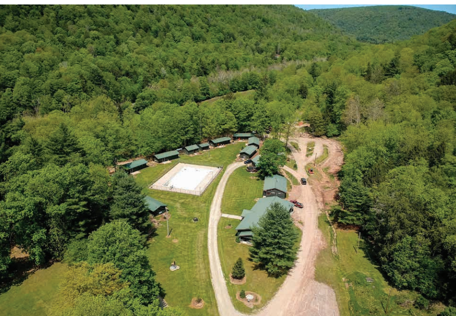
ELK CREEK ESCAPE

Elk Creek Escape is at 47 Covered Bridge