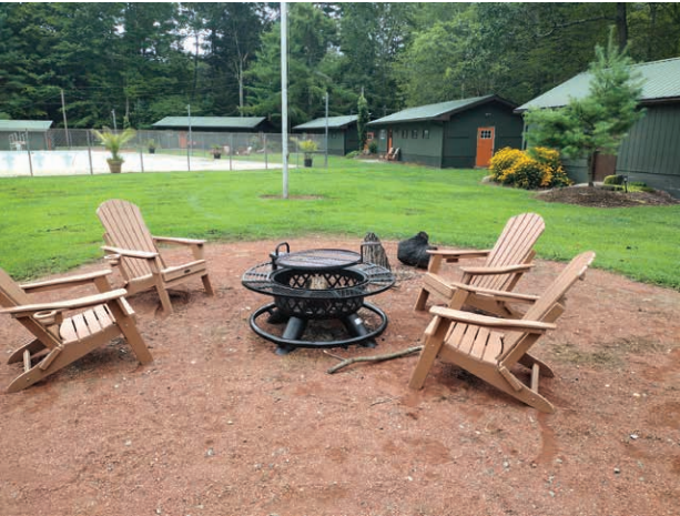
STAY A WHILE: Time slows down at Elk Creek Escape. Enjoy a cozy fire pit with your family and friends.

Everyone's idea of fun is different, but there is one similarity: Everyone can find fun at Elk Creek Escape! 🍷