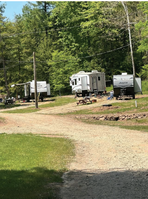
PICK YOUR SPOT: RV campers have a selection of more than 50 different hookups. Stay for the weekend, seasonally or yearly.