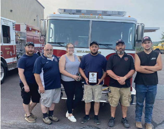
HILLSGROVE VOLUNTEER FIRE COMPANY